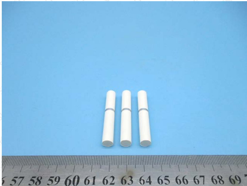
CPC240031-1: KAI HNB tobacco - Amber